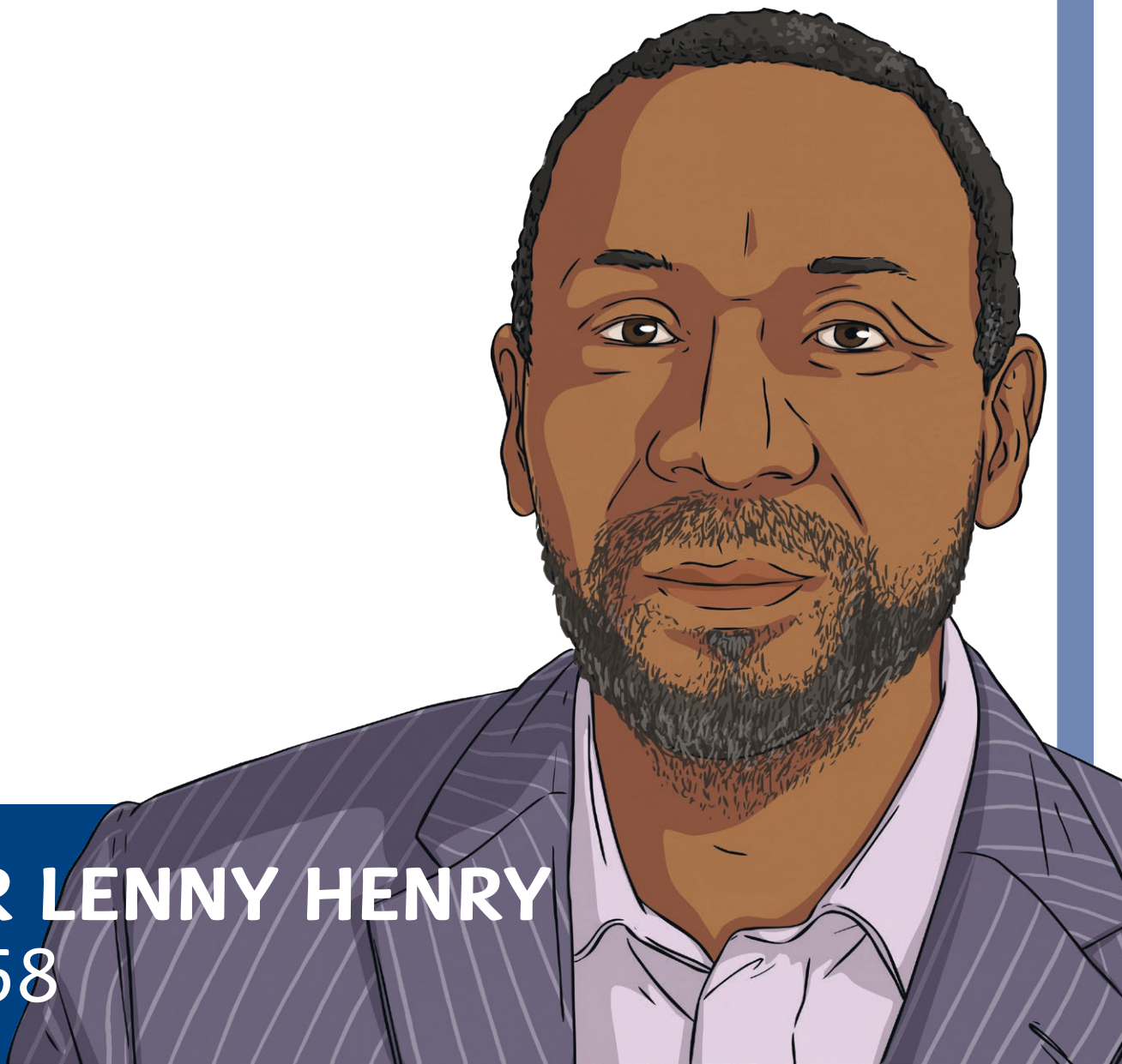
SIR LENNY HENRY 1958

Lenny Henry was knighted in the 2015 Queen's Birthday Honours for his services to drama and charity.