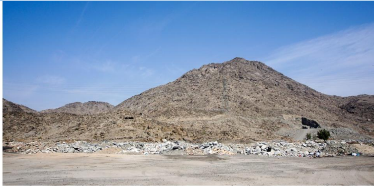
Mount Hira, the location where Muslims believe Mohammad was meditating when he saw the Angel Jibril